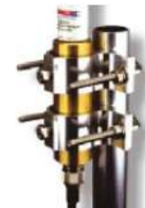
FM2 Mounting Kit (Sold separately)