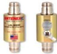
Lightning Arrestor LABH350NN (Sold Separately)