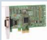
PX-235: LP PCIe 1xRS232 1MBaud