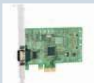
PX-246: PCIe 1xRS232 1MBaud