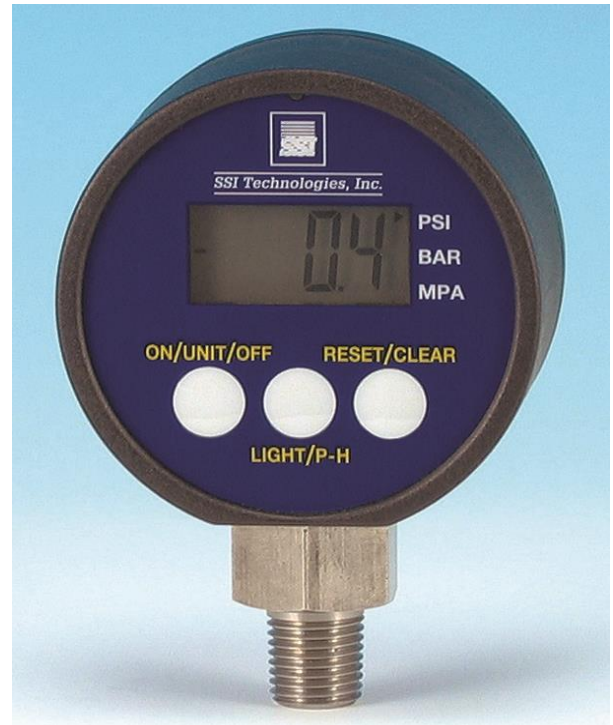
MediaGauge™ Model MG1-9V

The MediaGauge™ MG1-9V digital pressure gauge has better accuracy, longer life and standard multiple functions which make it a better choice than mechanical pressure gauges.