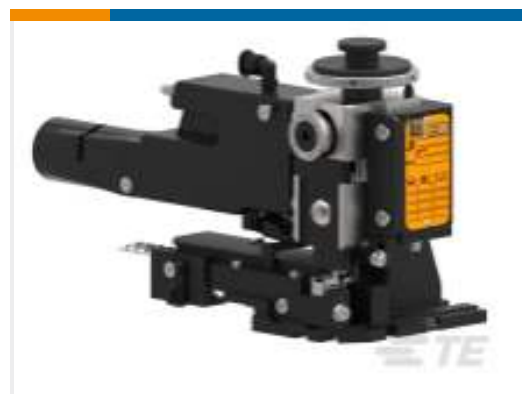
TE Part # 2836399-2 OCEAN_2.0_Applicator-S-042F070F