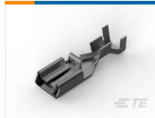
TE Part # 626580-2 PL 250 REC 1.0-2.5MM2 0.35X26.54 TPPHBZ