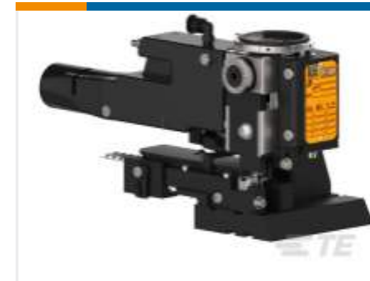
TE Part # 2-2266511-2 OCEAN_2.0_Applicator-S-110F160OV