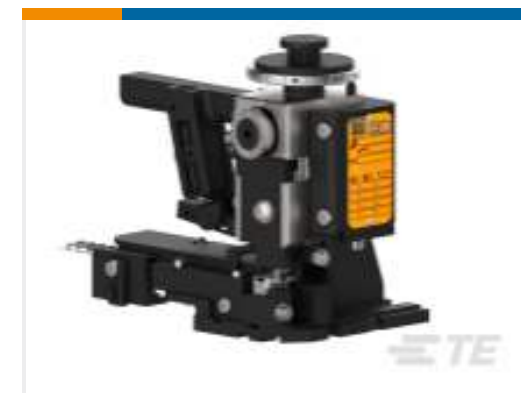
TE Part # 2836399-1 OCEAN_2.0_Applicator-S-042F070F