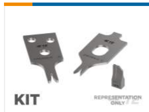
TE Part # 7-2266511-7 OCEAN_2.0_SPARE_PART_KIT- 110F160OV