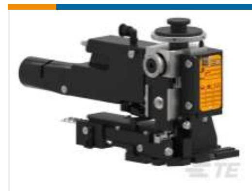
TE Part # 2266511-2 OCEAN_2.0_Applicator-S-110F160OV