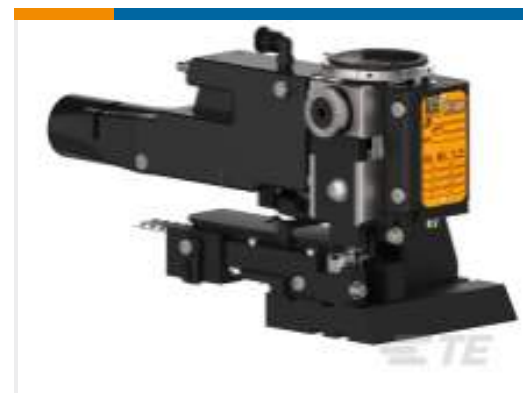
TE Part # 2-2836399-2 OCEAN_2.0_Applicator-S-042F070F