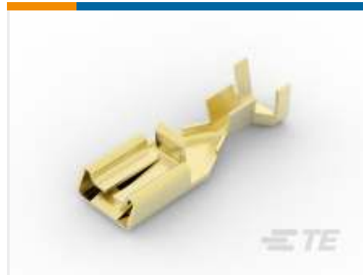
TE Part # 626580-1 PL 250 REC 1.0-2.5 MM2 0.35X 26.54 BR