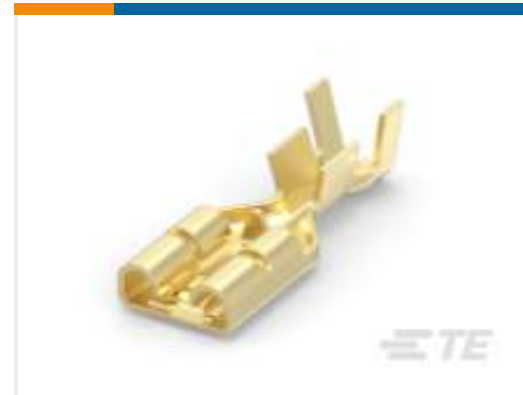
TE Part # 1380089-1 PL MKIII .250 REC 1.0-2.5MM2