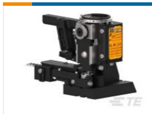
TE Part # 2-2836399-1 OCEAN_2.0_Applicator-S-042F070F