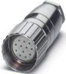
Cable connector, straight, shielded: No, Screw locking, M23, Number of positions: 12, Type of contact: Socket, Crimp connection

Please be informed that the data shown in this PDF Document is generated from our Online Catalog. Please find the complete data in the user's documentation. Our General Terms of Use for Downloads are valid ( http://phoenixcontact.com/download )