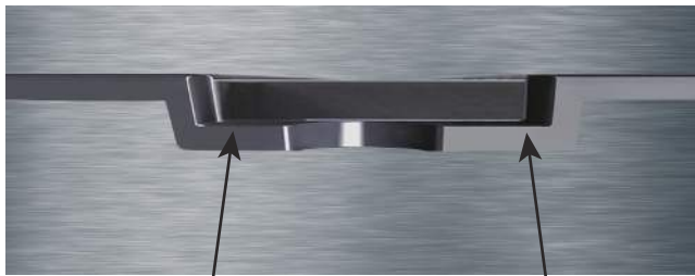
Flat pocket bottom \leq 5^\circ sidewall draft angle