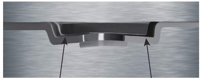
Curved pocket bottom "Bathtub" corners

A large sidewall draft angle in the traditional pocket allows chip movement up the wall and a pocket that is not flat allows Z-axis movement which can cause repeatability problems at the pick-up point.