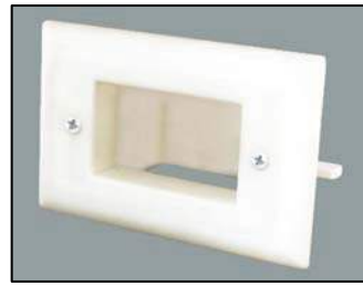
45-0008 & 45-0009 – Front View