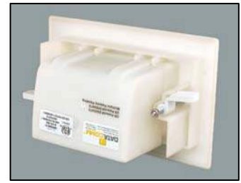
45-0008 – Back View