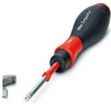
Torque screwdriver, series: RC

https://www.phoenixcontact.com/us/products/1607456