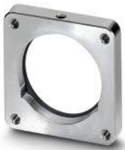
Square mounting flange, Axial seal, 4xM3, flange dimensions: 35 mm x 35 mm, series: RF, Alternative product in accordance with RoHS II without Exemption 6c (Pb <0.1%) item no.: 1242369

https://www.phoenixcontact.com/us/products/1607905