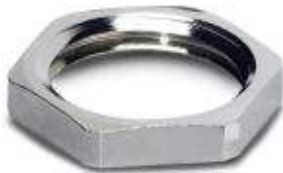
Flat nut with Pg9 thread

Please be informed that the data shown in this PDF Document is generated from our Online Catalog. Please find the complete data in the user's documentation. Our General Terms of Use for Downloads are valid ( http://download.phoenixcontact.com )