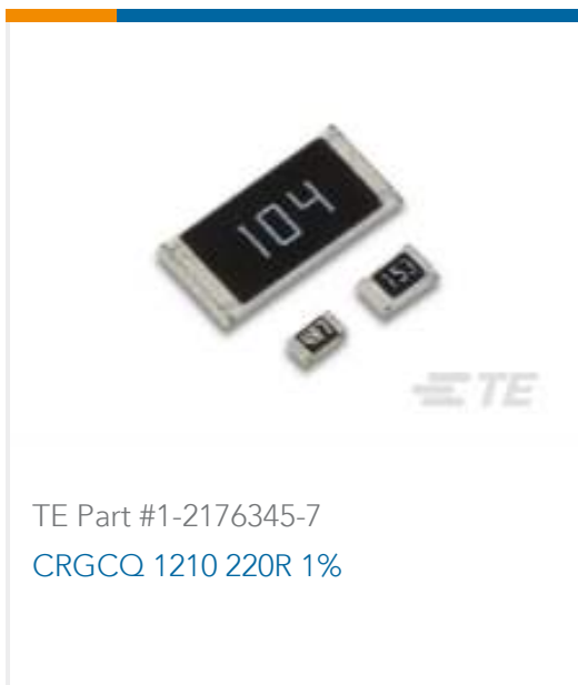
TE Part #1-2176345-7 CRGCQ 1210 220R 1%