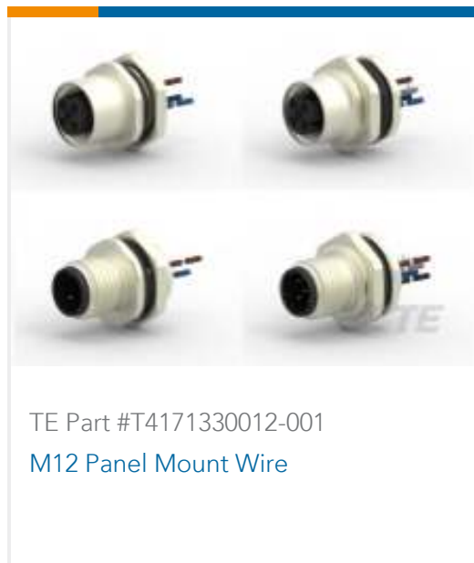
TE Part #T4171330012-001 M12 Panel Mount Wire