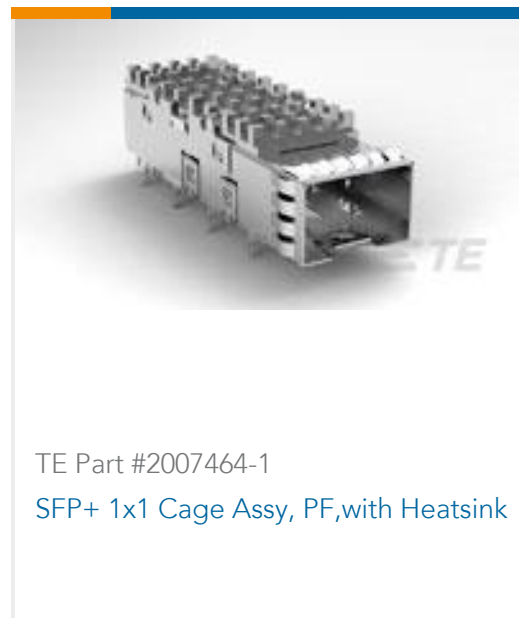
TE Part #2007464-1 SFP+ 1x1 Cage Assy, PF,with Heatsink