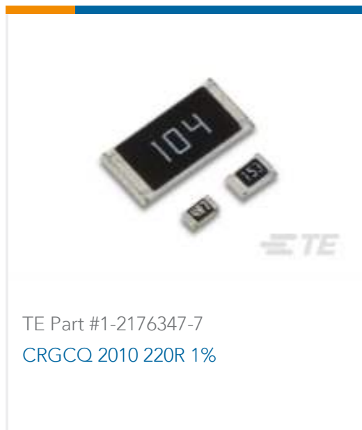
TE Part #1-2176347-7 CRGCQ 2010 220R 1%