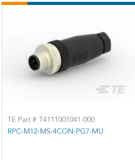
TE Part # T4111001041-000 RPC-M12-MS-4CON-PG7-MU