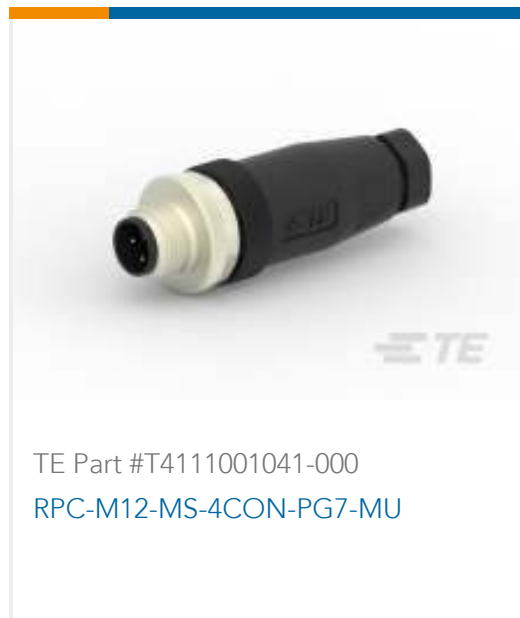
TE Part #T4111001041-000 RPC-M12-MS-4CON-PG7-MU