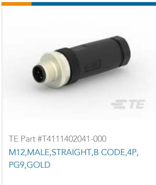
TE Part #T4111402041-000 M12,MALE,STRAIGHT,B CODE,4P, PG9,GOLD