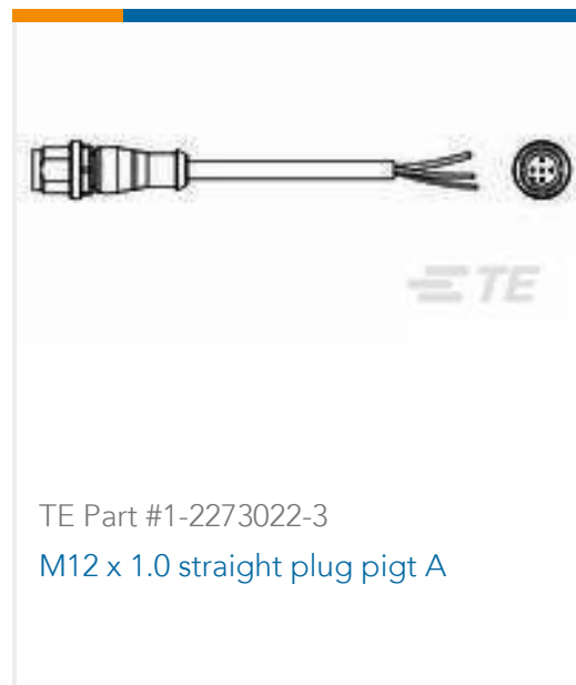
TE Part #1-2273022-3 M12 x 1.0 straight plug pigt A