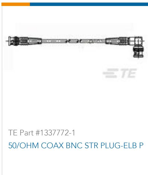
TE Part #1337772-1 50/OHM COAX BNC STR PLUG-ELB P