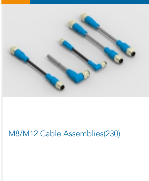
M8/M12 Cable Assemblies(230)