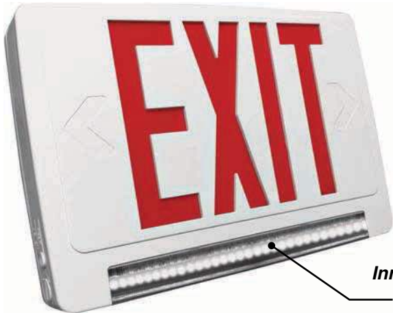
Innovative Compact Lightpipe Design