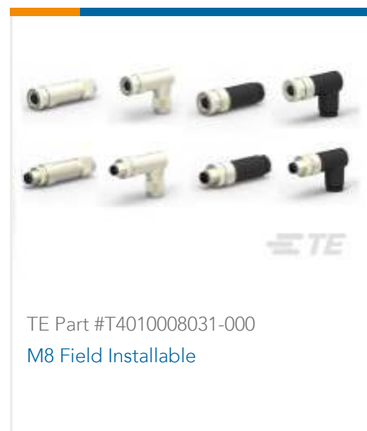
TE Part #T4010008031-000 M8 Field Installable