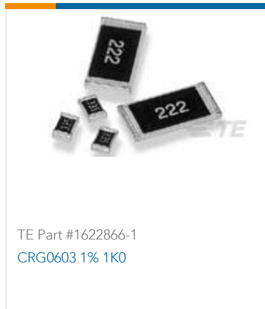
TE Part #1622866-1 CRG0603 1% 1K0