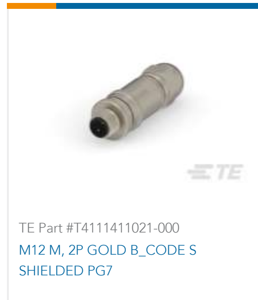
TE Part #T4111411021-000 M12 M, 2P GOLD B_CODE S SHIELDED PG7