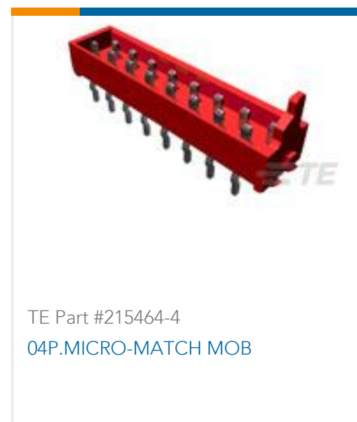
TE Part #215464-4 04P.MICRO-MATCH MOB