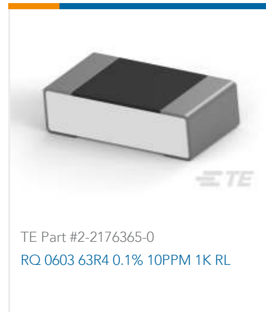
TE Part #2-2176365-0 RQ.0603 63R4 0.1% 10PPM 1K RL