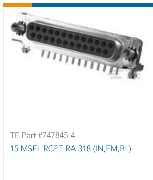
TE Part #747845-4 15 MSFL RCPT RA 318 (IN,FM,BL)