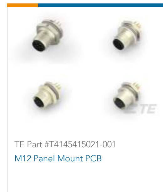
TE Part #T4145415021-001 M12 Panel Mount PCB