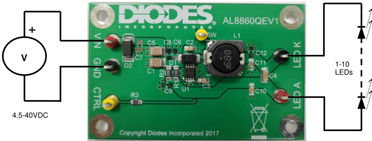
Figure 1: AL8860QEV1 evaluation board and connection diagram

Warning: At 40V nominal operation with 1.5A output, the LED will be hot and very bright