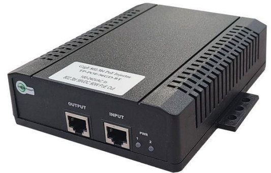
TP-POE-56GD-BT High Power Injector