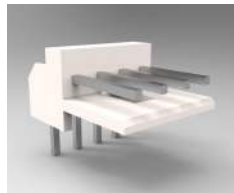
Vertical Mount Type