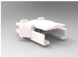
Free Hanging Type