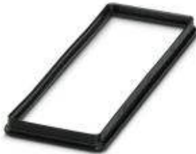
Profile gasket for sleeve housing type B24.....EEE

Please be informed that the data shown in this PDF Document is generated from our Online Catalog. Please find the complete data in the user's documentation. Our General Terms of Use for Downloads are valid ( http://phoenixcontact.com/download )