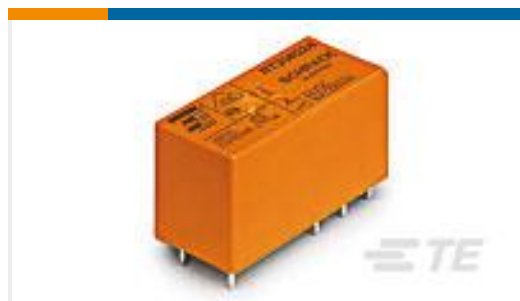
TE Part #1-1415898-1 RTS3T048