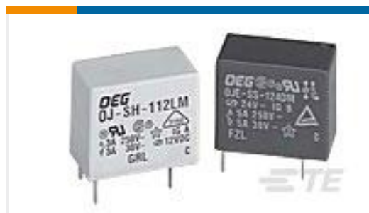
TE Part #1721874-5 OJ-SS-112LMH2-WG