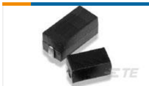
TE Part #1879233-5 SMW5 R15 5%