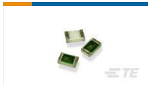
TE Part #6-1879338-2 CPF 0603 115K 1% 50PPM 1K RL