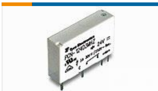
TE Part #3-1461491-8 PCN-124D3MHZ,001