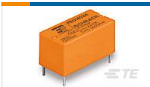
TE Part #4-1415535-9 PE034012