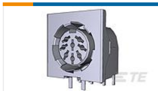
TE Part #5212047-1 8 CIRC DIN RCPT GRND SHLD