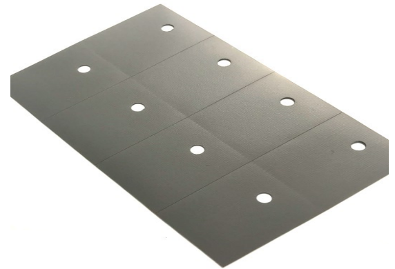
Standard SILTEL SF-TC3.0 Cross Section