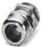
Cable gland, Cable gland material: Brass, nickel-plated, External cable diameter 13 mm ... 18 mm, Shielding: No, Connecting thread: Pg21, Color: silver

Cable gland - G-INS-PG21-M68N-NNES-S - 1411175