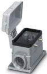
HEAVYCON box mounting base B10, with double locking latch, height 52 mm, with supports 2xM25, with protective cover

Please be informed that the data shown in this PDF Document is generated from our Online Catalog. Please find the complete data in the user's documentation. Our General Terms of Use for Downloads are valid ( http://download.phoenixcontact.com )