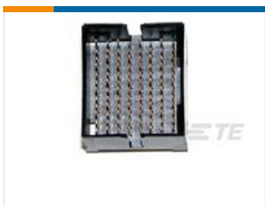
TE Part #1934346-1 Tin Man Header Assy 3x16 Double