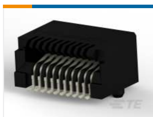
TE Part # CAT-SF59-C76264 SFP Connectors