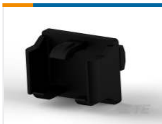
TE Part # 1761394-1 DUST COVER, SFP, GANGED & STACKED