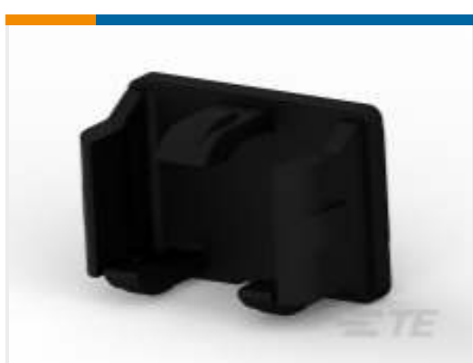
TE Part # 1367147-1 SFP COVER, UNPLATED