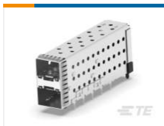
TE Part #2007562-6 SFP+ Stacked Cage Assemblies