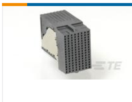
TE Part #1934229-1 Tin Man Recept Assy 3 Pair16 Column