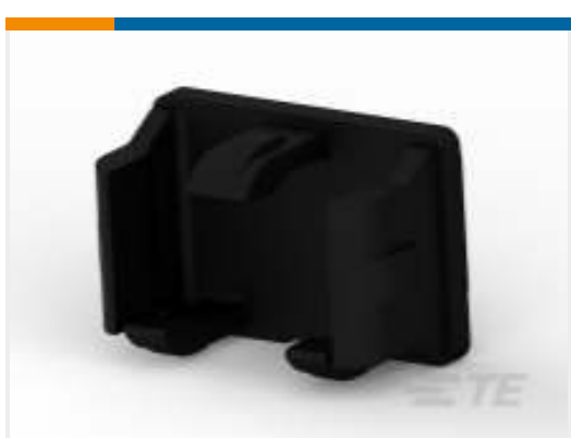
TE Part # 1367147-3 SFP COVER, UNPL, NO LOGO