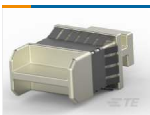
TE Part # 1888901-1 SFP+ EMI Plug