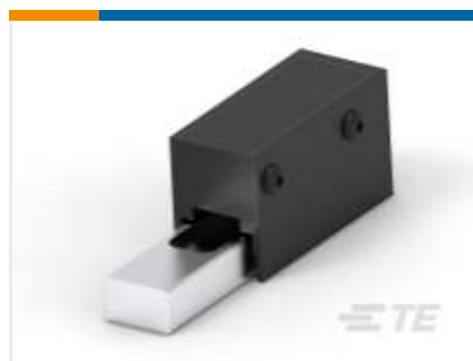
TE Part # 2215077-3 ASSY, SEATING TOOL, SFP