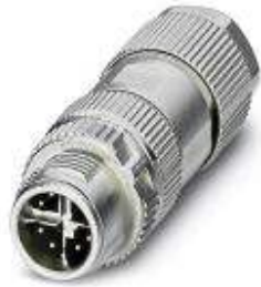
M12 connector, CAT6<sub>A</sub>, connector, straight, 8-pos., shielded, for cable diameters of 4 mm ... 8 mm

Please be informed that the data shown in this PDF Document is generated from our Online Catalog. Please find the complete data in the user's documentation. Our General Terms of Use for Downloads are valid ( http://download.phoenixcontact.com )