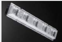
HB-5X1 123 MM X 25 MM PMMA