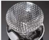
SPUTNIK D= 26 MM PMMA