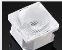
LAURA 21.6 MM X 21.6 MM PMMA

CA11959_LAURA-RS-PIN CA12011_LAURA-SS-PIN CA11960_LAURA-D-PIN CA11837_LAURA-M-PIN CA12012_LAURA-O-PIN CA12344_LAURA-W-PIN