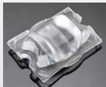
STRADA-B/B2 15.4 MM X 19.6 MM PMMA

OSRAM PLATINUM/DRAGON+ C11132_STRADA-DW CA11180_STRADA-DW