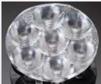
TAMPA D= 38 MM (7UP) PMMA

SHARP DOUBLE DOME C11670_ANNA-7-S C11679_ANNA-7-M C11682_ANNA-7-W