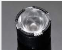
LISA2-PIN D= 9.9 MM PMMA