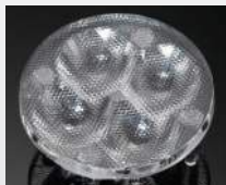
CUTE-4 D= 35 MM (4UP) PMMA

C11793_ANNA-40-4-S C11794_ANNA-40-4-M C11795_ANNA-40-4-W