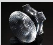
HEIDI D= 21.6 MM PMMA