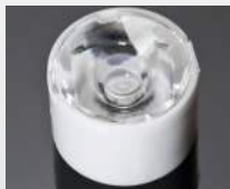
LISA D= 10.8 - 11 MM PMMA

CREE XP-E / XP-G CP11627_LISA-RS CP10641_LISA-SS