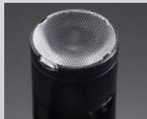
LEILA D= 21.6 MM PMMA

CA12124_NIS83-MX-2-RS CA12123_NIS83-MX-2-SS CA12122_NIS83-MX-2-D CA12126_NIS83-MX-2-M