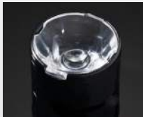
TINA2 D= 16.1 MM PMMA

CP12687_TINA2-RS CP12688_TINA2-D CP12689_TINA2-O CP12690_TINA2-M