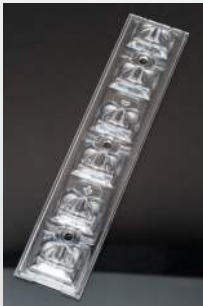
STRADA-T-6X1 25.2 MM X 120 MM PMMA

CREE XP-E / XP-G C11918_STRADA-T-6X1-DNW C12449_STRADA-T-6X1-DWC