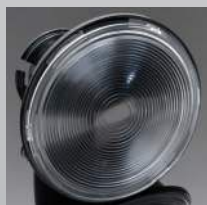
LENA D= 111 MM METALLIZED PC

SHARP MEGAZENIGATA CN12293_LENA-S CN12296_LENA-S-DL CN12294_LENA-M CN12297_LENA-M-DL CN12295_LENA-W CN12298_LENA-W-DL