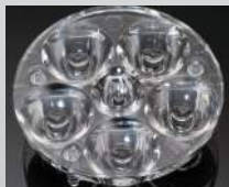
EMY D= 50 MM (6UP) PMMA

CREE MX6 / MX3 C10385_NIS83-MX-4-SS C10386_NIS83-MX-4-M C10387_NIS83-MX-4-W