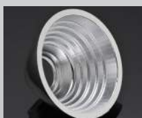
TYRA3 D= 40 MM METALLIZED PC

CREE MP-L CA11475_TYRA2-S CA11476_TYRA2-M CA11477_TYRA2-W