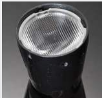
EYA D= 30 MM PMMA

FCN11257_LO1-RS FCN11259_LO1-D FCN11260_LO1-O FCN11258_LO1-M FCN11466_LO1-M2 FCN11262_LO1-REC FCN11261_LO1-W