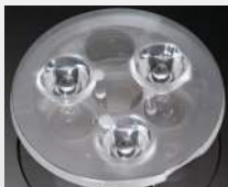
ANNA-3 D= 50 MM (3UP) PMMA

C11716_ANNA-40-7-S C11717_ANNA-40-7-M C11718_ANNA-40-7-W