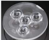
ANNA-4 D= 50 MM (4UP) PMMA