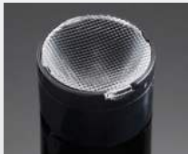
LEILA D= 21.6 MM PMMA