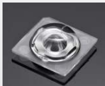
SIRI-A 13.9 MM X 13.9 MM PMMA