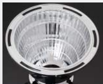
LENA D= 111 MM METALLIZED PC

CREE CXA20 CN12106_LENA-S CN12107_LENA-S-DL CN12163_LENA-M CN12167_LENA-M-DL CN12108_LENA-W CN12109_LENA-W-DL