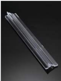
SOPHIE 150 X 20 MM PMMA

PHILIPS LUMILEDS LUXEON S CP12090_VENLA-S-IRIS