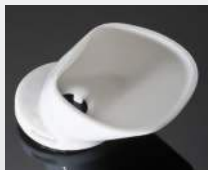
RITA D= 36 X 29 MM PC

SHARP MINI ZENIGATA C10982_CINDY-S C10983_CINDY-M C10984_CINDY-W