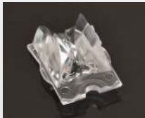
STRADA-T-DW 15.5 MM X 19.6 MM PMMA

CREE XP-E / XP-G C11425_STRADA-T-DW CA11426_STRADA-T-DW