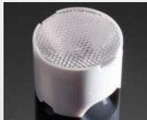
LEILA D= 21.6 MM PMMA