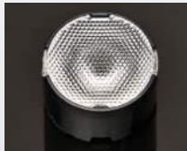
TINA2 D= 16.1 MM PMMA