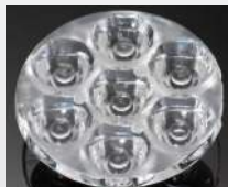
ANNA-7 D= 40 MM (7UP) PMMA