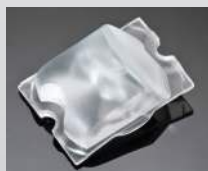
STRADA-FT 15.5 MM X 19.6 MM PMMA

CREE MX6 / MX3 C12331_STRADA-T-DW CA12333_STRADA-T-DW