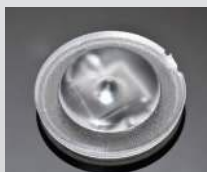
JULIA-A 18.9 MM X 4.7 MM PMMA

CREE XP-E / XP-G & SEOUL Z5 F11947_JULIA-A FA11948_JULIA-A