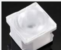
LAURA 21.6 MM X 21.6 MM PMMA

CA11974_LAURA-RS CA11977_LAURA-SS CA11975_LAURA-D CA11976_LAURA-M CA11978_LAURA-O CA11427_LAURA-REF-W CA12570_LAURA-W CA11978_LAURA-WW