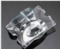
STRADA-FW 15.5 MM X 19.6 MM PMMA

CREE MX6 / MX3 C12329_STRADA-T-DN CA12332_STRADA-T-DN