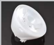
VENLA-IRIS D= 45 MM PC

SEOUL Z5 FCN12076_IRIS-SCREW FCA12077_IRIS