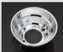
BROOKE-SCR D= 45 MM METALLIZED PC

BRIDGELUX ES-SERIES CA11181_BROOKE-S CA11182_BROOKE-M CA11183_BROOKE-W