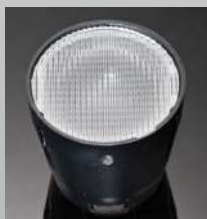
RGBX D= 30 MM PMMA

NICHIA NCS19 / NVS19 F11947_JULIA-A FA11948_JULIA-A