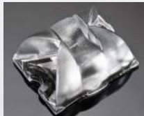
STRADA-A 15.4 MM X 19.6 MM PMMA

CREE XP-E / XP-G C10818_STRADA-A CA10823_STRADA-A