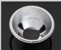
MINNIE D= 32.4 MM METALLIZED PC

OSRAM OSOLON C12512_RITA-A CA12514_RITA-A