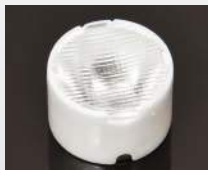
TINA D= 16.1 MM PMMA

CREE XM-L FA11905_TINA-3-S FA11902_TINA-3-W FA11903_TINA-3-WW FA11904_TINA-3-WWW