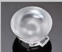
TINA-O-PLUS D= 16 MM PMMA

CA12346_TINA2-RS CA12347_TINA2-D CA12348_TINA2-M CA12349_TINA2-O CA12350_TINA2-W CA12403_TINA2-WW