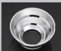
BROOKE (MOLEX) D= 45 MM METALLIZED PC

SHARP MEGAZENIGATA C12083_BROOKE-SCR-M C12084_BROOKE-SCR-W