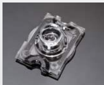
STRADA-S 15.5MM X 19.6 MM PMMA

PHILIPS LUMILEDS LUXEON REBEL ES C12353_LOTTA-A2 CA12396_LOTTA-A2