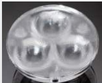
CUTE-3 D= 35 MM (3UP) PMMA

SHARP DOUBLE DOME C11916_SATU-S C11917_SATU-O C11602_SATU-M C11544_SATU-W