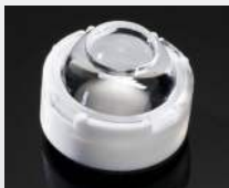
TINA3 D= 16.1 MM PMMA

PHILIPS LUMILEDS LUXEON REBEL FA11905_TINA3-S FA11870_TINA3-OO FA11824_TINA3-W FA11825_TINA3-WW FA11826_TINA3-WWW