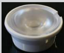
MIRA (with holder) D= 35 MM PC

C12500_MIRA-M C12501_MIRA-W C12502_MIRA-WW