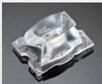
STRADA-DW 15.4 MM X 19.6 MM PMMA

OSRAM PLATINUM / DRAGON+ C10915_STRADA-C CA10916_STRADA-C