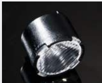
LISA2-PIN D= 9.9 MM PMMA

FP11057_LISA2-RS-PIN FP10998_LISA2-M-PIN FP11127_LISA2-O-PIN FP11855_LISA2-O-90-PIN FP10999_LISA2-W-PIN FP11000_LISA2-WW-PIN FP11954_LISA2-WWW-PIN