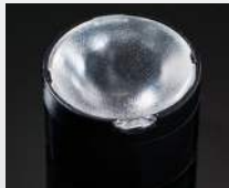
LEILA D= 21.6 MM PMMA

PHILIPS LUMILEDS LUXEON REBEL ES CA11929_LR2-RS CA11930_LR2-D CA11931_LR2-M CA12629_LR2-O-90 CA12394_LR2-W