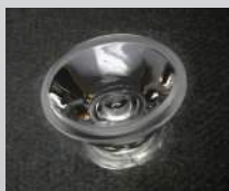
IRINA D= 24.7 MM PMMA