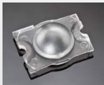
STRADA-C/C2 15.5 MM X 19.6MM PMMA

CREE XP-E / XP-G C11252_STRADA-C2 CA11253_STRADA-C2