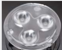
GT3 D= 35 MM (3UP) PMMA

OSRAM PLATINUM/DAGON+ C10710_CUTE-3-S C10711_CUTE-3-M C10712_CUTE-3-W