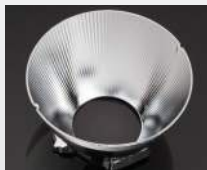
BRITNEY D= 70 MM METALLIZED PC

BRIDGELUX RS-SERIES CA11401_BRITNEY-M CA11402_BRITNEY-W