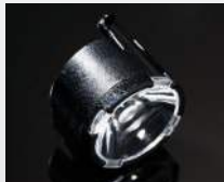
LISA2-CLIP D=9.9 MM PMMA

LUXEON REBEL FP11086_LISA2-RS-CLIP FP11072_LISA2-M-CLIP FP11122_LISA2-O-CLIP FP11858_LISA2-O-90-CLIP FP11073_LISA2-W-CLIP FP11074_LISA2-WW-CLIP FP11952_LISA2-WWW-CLIP