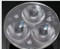
MARTHA / DOLLY D= 50 MM (3UP) PMMA

NICHIA 6Nx83 / 3Nx83 C11281_NIS83-MX-5-D C10472_RER-5-M C10814_NIS83-MX-5-W