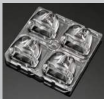
STRADA 2X2-A-T 50 MM X 50 MM PMMA