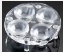
ANGIE D= 34 MM (4UP) PMMA

SHARP DOUBLE DOME C11814_SANDRA-12-M C11700_SANDRA-12-W