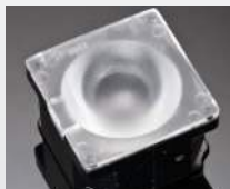
LAURA 21.6 MM X 21.6 MM PMMA