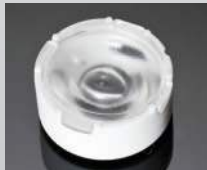
TINA3 D= 16.1 MM PMMA

SEOUL Z5 CP11627_LISA-RS CP10641_LISA-SS