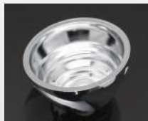
VENLA D= 45 MM METALLIZED PC

CITIZEN CL-L330 C12119_BROOKE-M C12120_BROOKE-W