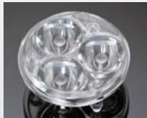
SATU D= 21.8 MM (3UP) PMMA

CREE XP-E / XP-G C11916_SATU-S C11917_SATU-O C11602_SATU-M C11544_SATU-W