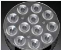
SANDRA D= 70 MM (12UP) PMMA

CREE XP-E / XP-G C11814_SANDRA-12-M C11700_SANDRA-12-W