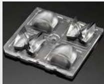
STRADA 2X2-DNW 50 MM X 50 MM PMMA

SHARP DOUBLE DOME C11918_STRADA-T-6X1-DNW C12449_STRADA-T-6x1-DWC