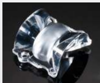
FLARE-B 29.0 MM X 24.5 MM X 14.5 MM PMMA

CREE MC-E / MC-E RGB CP10961_RGBX-SS CP10944_RGBX-M CP10945_RGBX-O