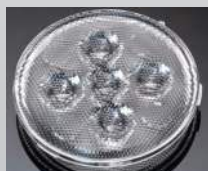
PENTA D= 35 MM (5UP) PMMA

CREE MX6 / MX3 C10436_NIS83-MX-3-M C10364_NIS83-MX-3-W