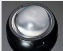
TWIDDLE D= 21.6 MM PMMA