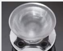
HEIDI D= 21.6 MM PMMA