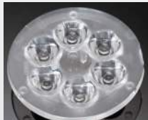
ANNA-6 D= 50 MM (6UP) PMMA

C11612_ANNA-50-5-S C11613_ANNA-50-5-M C11614_ANNA-50-5-W