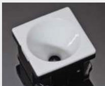
LAURA REFLECTOR 21.6 MM X 21.6 MM PMMA

CREE MC-E CA10716_BOOM-S CA10928_BOOM-M CA10929_BOOM-W