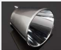
REGINA D= 19 MM METALLIZED PC