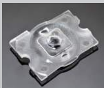
LOTTA-A 15.4 MM X 19.6 MM PMMA

SHARP DOUBLE DOME C10946_FLARE-B CA10932_FLARE-B