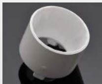
LISA2 REFLECTOR D= 9.9 MM PC