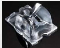
STRADA-T-DW 15.5MM X 19.6 MM PMMA

SEOUL Z5 C11425_STRADA-T-DW CA11426_STRADA-T-DW