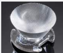
EMILY D= 26 MM PMMA

CA11663_HEIDI-RS CA12242_HEIDI-SS CA11264_HEIDI-D CA11265_HEIDI-M CA11266_HEIDI-O CA11267_HEIDI-O-90 CA11268_HEIDI-W CA12079_HEIDI-W2