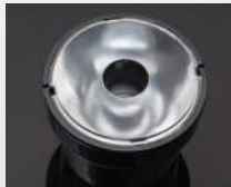
IRIS D= 38 MM PMMA

CREE MC-E CN10861_IRIS CN10953_IRIS-M CN11470_IRIS-O