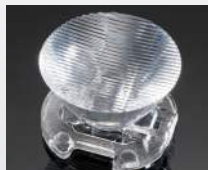
EMILY D= 26 MM PMMA

CA11387_EMILY-SS CA11388_EMILY-M CA11391_EMILY-M2 CA11389_EMILY-O CA11390_EMILY-O-90 CA11934_EMILY-W