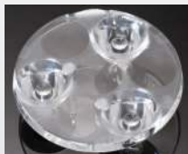
ANNA-3 D= 40 MM (3UP) PMMA