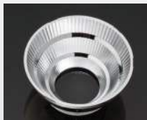
BROOKE D= 45 MM METALLIZED PC

NICHIA NSBLL110 C12358_TYRA3-W C12359_TYRA3-WW