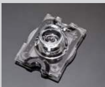
STRADA-S 13.9 MM X 19.6 MM PMMA

CREE XP-E / XP-G C12114_STRADA-S CA12115_STRADA-S