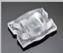
STRADA-DN 15.4 MM X 19.6 MM PMMA

NICHIA 6Nx83 / 3Nx83 C11244_STRADA-DN CA11245_STRADA-DN