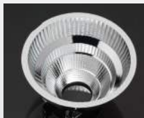
TYRA (TYCO) D= 40 MM METALLIZED PC

CREE MP-L C11394_TYRA-S C11395_TYRA-M C11396_TYRA-W