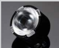
LISA2-CLIP D= 9.9 MM PMMA

FP11055_LISA2-RS-PIN FP10995_LISA2-M-PIN FP11125_LISA2-O-PIN FP11851_LISA2-O-90-PIN FP10996_LISA2-W-PIN FP10997_LISA2-WW-PIN FP11429_LISA2-WWW-PIN