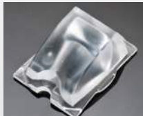
STRADA-T-DN 15.5 MM X 19.6 MM PMMA

CREE XP-E / XP-G C11415_STRADA-T-DN CA11416_STRADA-T-DN