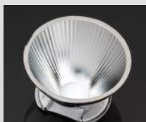
TYRA2 D= 40 MM METALLIZED PC

CREE MP-L C11394_TYRA-S C11395_TYRA-M C11396_TYRA-W