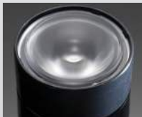
EVA D= 37.7 MM PMMA