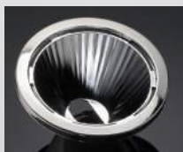
MIRELLA D= 50 MM METALLIZED PC

BRIDGELUX RS-SERIES CA11401_BRITNEY-M CA11402_BRITNEY-W