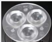
MARTHA / TUIJA D= 50 MM (3UP) PMMA

C11606_ANNA-50-3-S C11607_ANNA-50-3-M C11608_ANNA-50-3-W