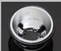
MINNIE (with holder) D= 35 MM METALLIZED PC

CREE MT-G C12095_MINNIE-M C11862_MINNIE-W C12097_MINNIE-WWW