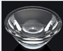
MIRA D= 32.4 MM PC

C10684_EVA-D C10685_EVA-M C10686_EVA-W C10909_EVA-WW