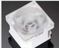
ROSE 21.6 MM X 21.6 MM PC (*COP)

FA10668_CXP-RS FA10667_CXP-SS FA10666_CXP-D FA10665_CXP-M FA10669_CXP-O FA11153_CXP-O-90 FA10708_CXP-W