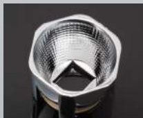
BOOM D= 22.2 MM METALLIZED PC

CREE MC-E CA10716_BOOM-S CA10928_BOOM-M CA10929_BOOM-W