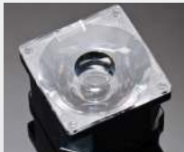
ROSE 21.6 MM X 21.6 MM PC