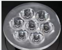
ANNA-7 D= 50 MM (3UP) PMMA

CREE XP-E / XP-G C11670_ANNA-7-S C11679_ANNA-7-M C11682_ANNA-7-W