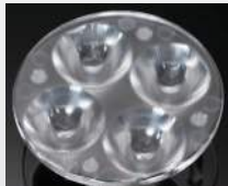
QUAK D= 50 MM (4UP) PMMA