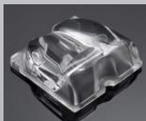
STRADA-SQ-A-T 25 MM X 25 MM PMMA

CREE MX6 / MX3 C12226_STRADA-FW CA12238_STRADA-FW