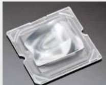
STRADA-SQ-T-DN 25 MM X 25 MM PMMA

PHILIPS LUMILEDS LUXEON M C12410_STRADA-SQ-A-T CA12411_STRADA-SQ-A-T