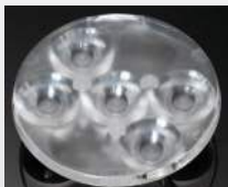
ANNA-5 D= 40 MM (5UP) PMMA

C10921_GT4-S C10922_GT4-M C10923_GT4-W C10975_GT4-WW