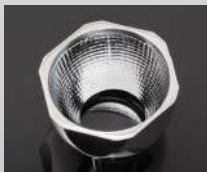
BRIDGET / LILY / CINDY D= 22.2 MM METALLIZED PC

BRIDGELUX LS-SERIES C10918_BRIDGET-S C10919_BRIDGET-M C10920_BRIDGET-W