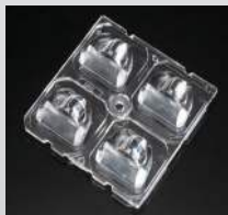
STRADA 2X2-DWC 50 MM X 50 MM PMMA