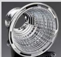
LENA D= 111 MM METALLIZED PC

BRIDGELUX RS CN12656_LENINA-S CN12657_LENINA-M CN12658_LENINA-W CN12659_LENINA-S-DL CN12660_LENINA-M-DL CN12661_LENINA-W-DL