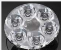
ANNA-6 D= 40 MM (6UP) PMMA

C11713_ANNA-40-5-S C11714_ANNA-40-5-M C11715_ANNA-40-5-W