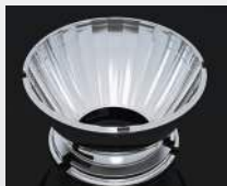
LENA D= 74 MM METALLIZED PC

CITIZEN CLL040 CN12706_LENINA-S CN12707_LENINA-M CN12708_LENINA-W CN12709_LENINA-S-DL CN12710_LENINA-M-DL CN12711_LENINA-W-DL