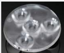
ANNA-4 D= 40 MM (4UP) PMMA

C11710_ANNA-40-3-S C11711_ANNA-40-3-M C11712_ANNA-40-3-W