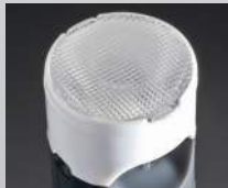
LEILA D= 21.6 MM PMMA

FA10696_LN2-RS FA10695_LN2-D FA10697_LN2-M FA11452_LN2-M2 FA11108_LN2-O-90 FA10698_LN2-REC