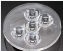
ANNA-5 D= 50 MM (5UP) PMMA

C11799_ANNA-50-4-S C11800_ANNA-50-4-M C11801_ANNA-50-4-W