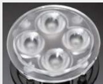
GT4 D= 35 MM (4UP) PMMA