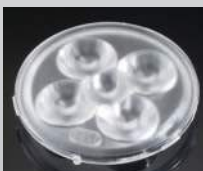
PENTA D= 35 MM (5UP) PMMA

PHILIPS LUMILEDS LUXEON REBEL / REBEL ES C11232_RER-7-MD C11230_RER-7-W C11231_RER-7-WW