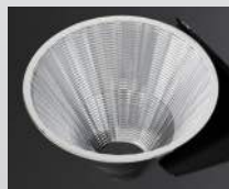
BARBARA D= 70 MM METALLIZED PC

PHILIPS LUMILEDS LUXEON S C11773_VENLA-S C11775_VENLA-M C11776_VENLA-W C11777_VENLA-WW