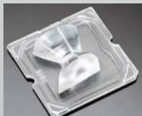
STRADA-SQ-T-DW 25 MM X 25 MM PMMA

SHARP DOUBLE DOME C11816_STRADA-SQ-T-DN CA11817_STRADA-SQ-T-DN