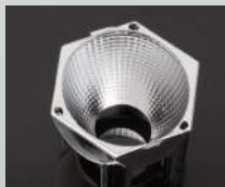
BOOMERANG D= 22.2 MM METALLIZED ABS