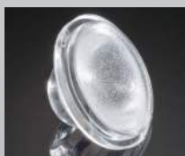
EVA D= 35 MM PMMA

CP12196_EVA-S CP12197_EVA-D CP12198_EVA-M CP12199_EVA-W CP12200_EVA-WW