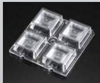
STRADA 2X2 50 MM X 50 MM PMMA

OSRAM PLATINUM/DAGON+ C10758_STRADA-A CA10820_STRADA-A