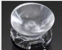
EMILY-WAS D= 26 MM PMMA

SEOUL Z5 CA12115_STRADA-S C12114_STRADA-S