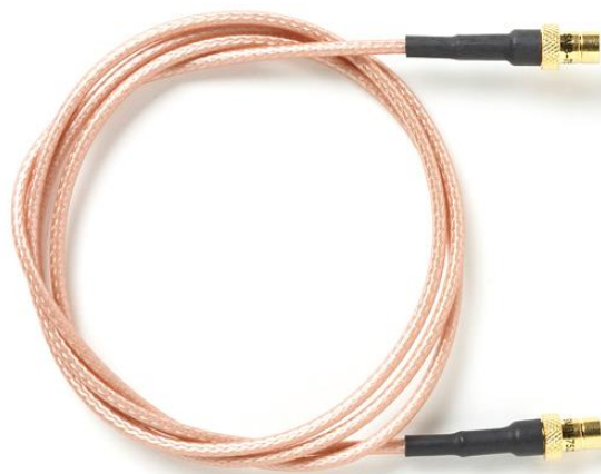
73072-VV SMB Jack to SMB Jack, RG179B/U, 75 Ohm

Cable is RG179B/U with length of 48" (1219mm)