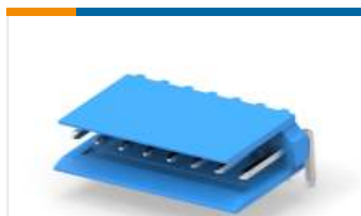
TE Part #281698-4 HE13/HE14 TH Headers, SRRA