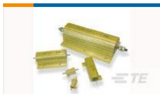
TE Part #1630027-1 HSC300 100R 5%