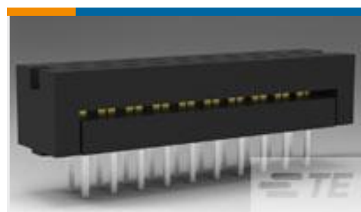
TE Part #1-746610-5 20 DIP PLUG, 100CL, LEAD FREE