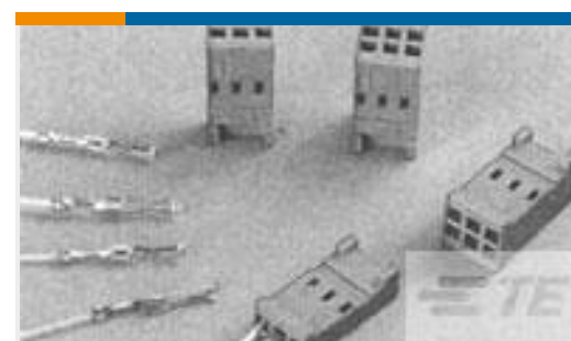
TE Part #188746-1 CONTACT REC HE13 COSI GOLD PLATED