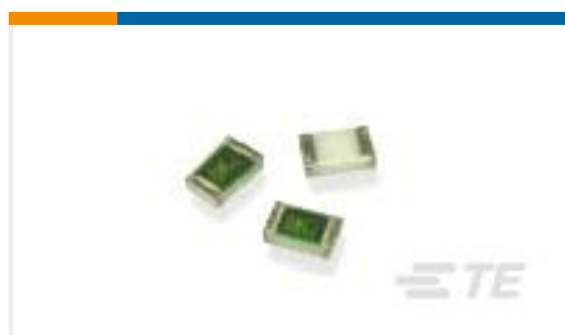
TE Part #1676377-2 RN 0805 56K2 0.1% 10PPM 1KRL