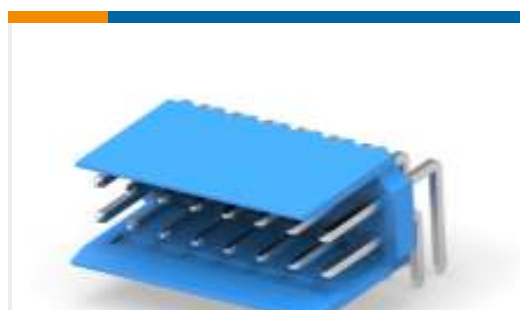
TE Part #281742-4 HE13/HE14 TH Headers, DRRA