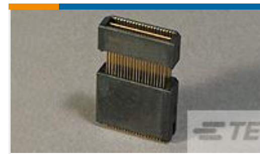
TE Part # 1658051-1 MSB0.80PL30ASY040FL,-,F,-TY