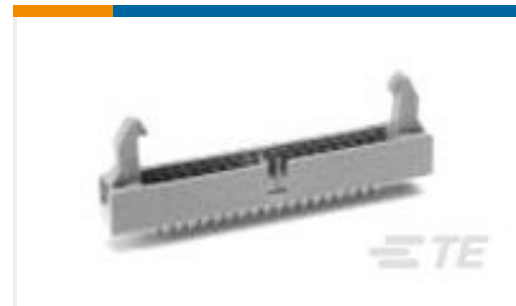
TE Part #1-1761686-5 IDC LOW PRO HDR 50P VERT LG LAT