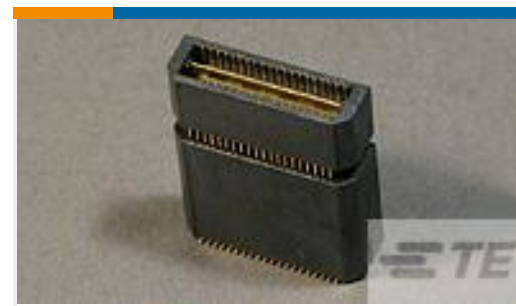
TE Part # 1658050-1 MSB0.80PL25ASY040FL,-,F,-TY