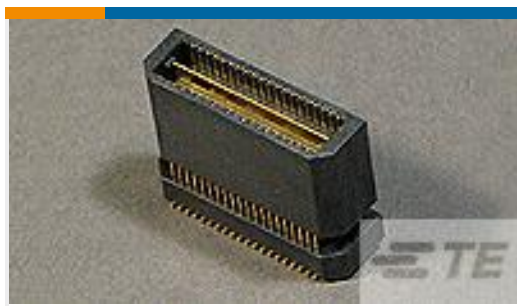
TE Part # 1658047-1 MSB0.80PL16ASY040FL,-,F,-TY