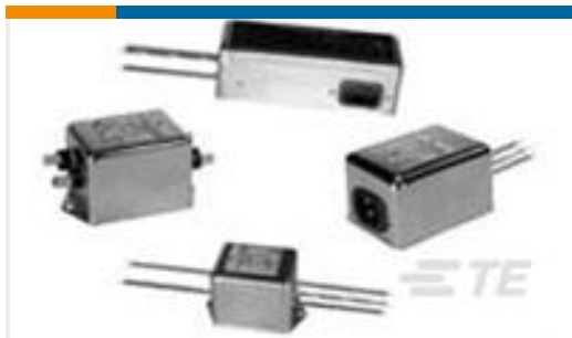
TE Part #6609048-5 6EQ1=F7262 S0