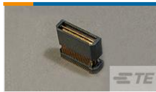
TE Part # 1658048-1 MSB0.80PL19ASY040FL,-,F,-TY