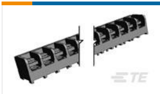
TE Part #6-1437653-8 6PCV-14-006=6PCV ASSEMBLY