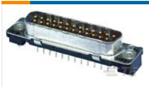
TE Part #747871-8 09 PLUG SP/FMS INSRT