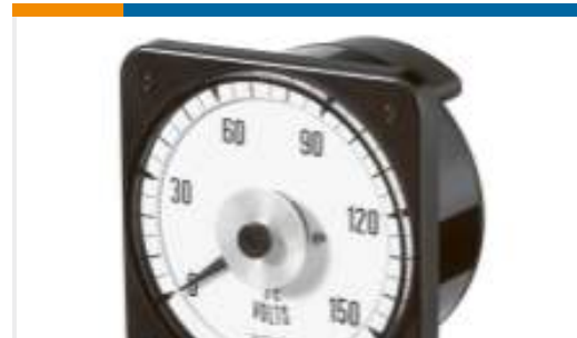
TE Part #CY0088-000 CI-007146APR/1