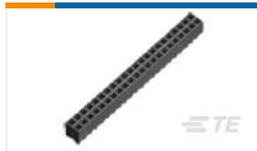
TE Part #7-1734506-6 RCPT, 2.0MM, 06P,VRT MT, 30 Au", 2.6 ST