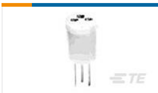
TE Part #1437508-7 8058-1G23=TO5 SOCKET 200 CIRC