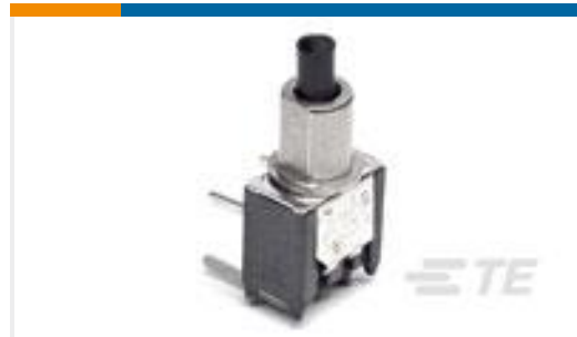
TE Part #1825096-5 TPA11CGRA204