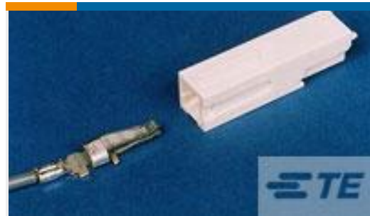
TE Part #556137-1 HSG,AMPINNERGY WTW,1 POS, WHITE