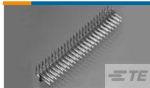
TE Part #2-5176837-1 44 AMPMODU 2MM, H, AU, LF