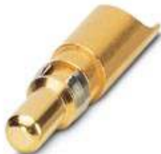
Power contacts, for D-SUB combination inserts, pin, solder cup, straight, rated current 40 A, gold-plated

Please be informed that the data shown in this PDF Document is generated from our Online Catalog. Please find the complete data in the user's documentation. Our General Terms of Use for Downloads are valid ( http://download.phoenixcontact.com )