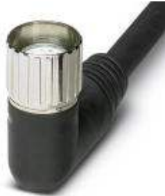
Socket M23, 19-pos., angled, shielded, with shielded, connected master cable, length: 10 m

Please be informed that the data shown in this PDF Document is generated from our Online Catalog. Please find the complete data in the user's documentation. Our General Terms of Use for Downloads are valid ( http://download.phoenixcontact.com )