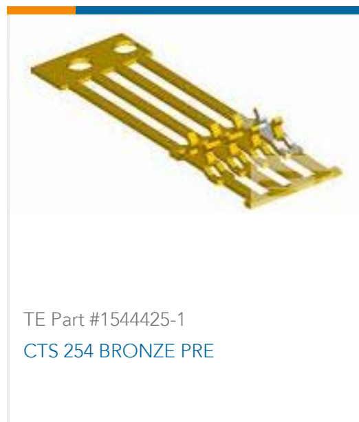
TE Part #1544425-1 CTS 254 BRONZE PRE