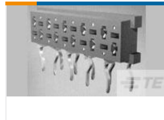
TE Part # 100400-8 MICRO-MATCH FSID NP