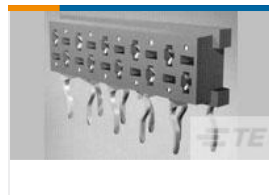
TE Part # 7-100400-8 MICRO-MATCH FSID NP