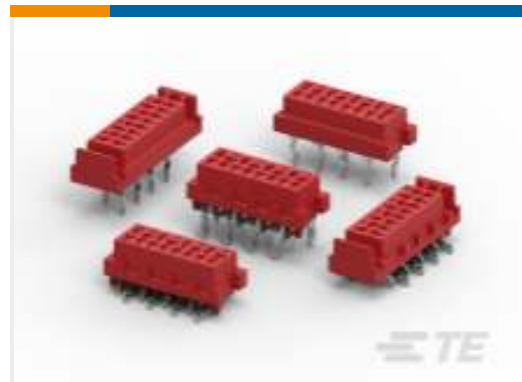
TE Part # CAT-M5833-F3492A Female-on-Board Connector, Top Entry