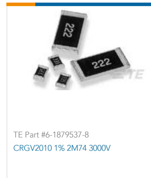
TE Part #6-1879537-8 CRGV2010 1% 2M74 3000V