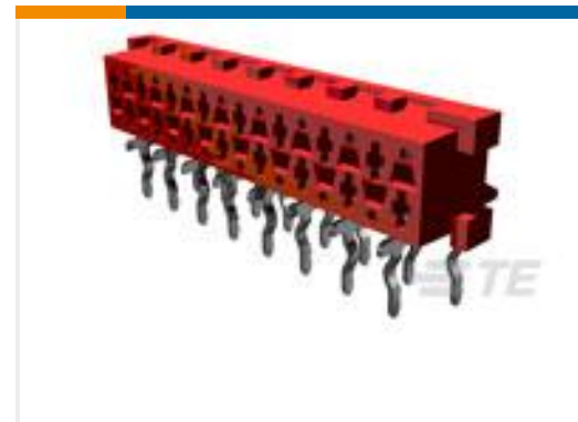
TE Part # 7-215460-8 MICRO-MATCH FSID P