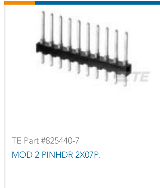
TE Part #825440-7 MOD 2 PINHDR 2X07P.