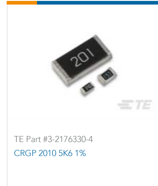
TE Part #3-2176330-4 CRGP 2010 5K6 1%