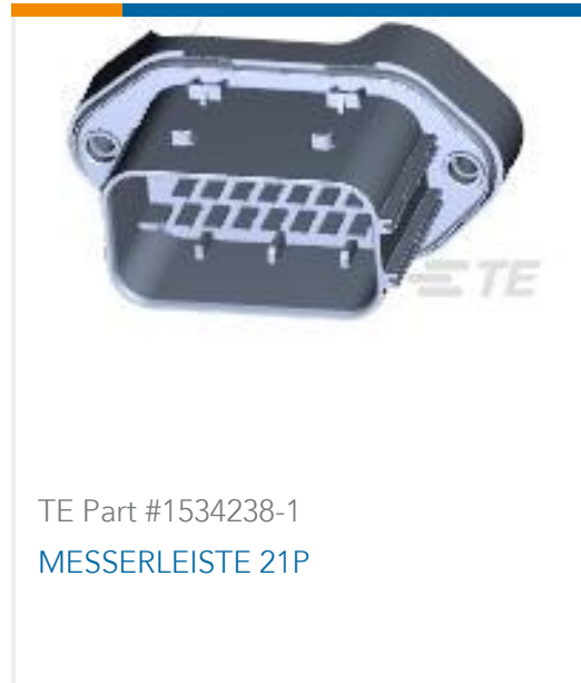
TE Part #1534238-1 MESSERLEISTE 21P