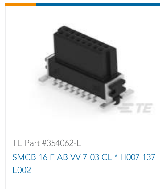
TE Part #354062-E SMCB 16 F AB VV 7-03 CL * H007 137 E002