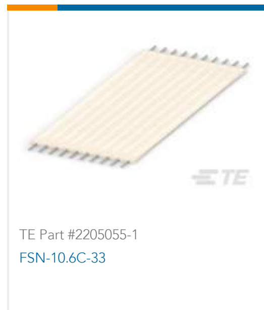
TE Part #2205055-1 FSN-10.6C-33