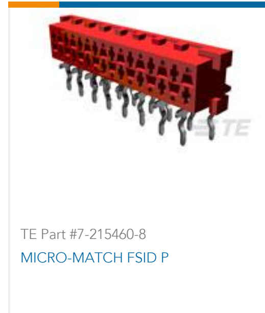
TE Part #7-215460-8 MICRO-MATCH FSID P