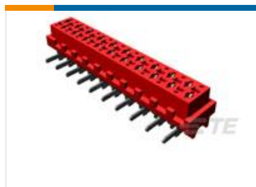
TE Part # 7-188431-8 MM 8p FIB SMD connector