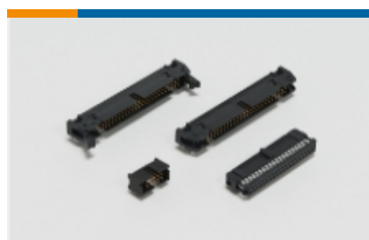
Ribbon Cable Connectors(185)