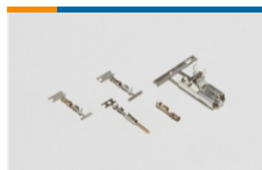
Wire-to-Board Connector Contacts(4)