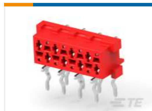
TE Part # 215460-8 MICRO-MATCH FEM.SE