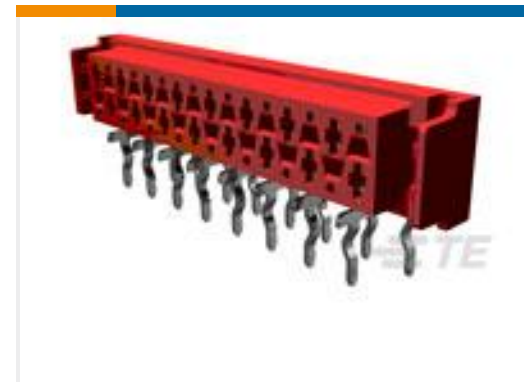
TE Part # 338070-8 MICRO-MATCH FEM.SE