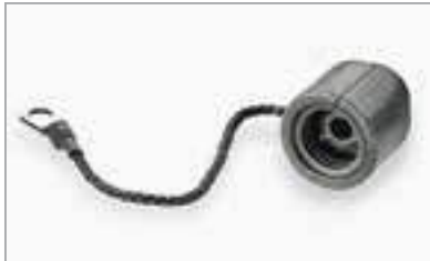
Receptacle Cap with Lug Terminal Attachment