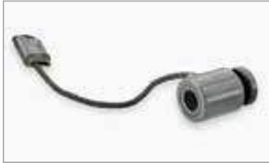
Plug Cap with Slip Knot

O.C.H. rubber caps provide an optimal solution to protect the cable/connector on a soldier system's applications. TE offers these molded rubber caps with a fused end, slip knot or lug terminal connection options, so end users can choose what works best for their solution. These caps are IP67 rated and built to withstand the rugged battlefield conditions of today's soldiers.