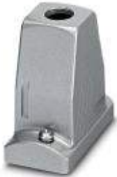
HEAVYCON ADVANCE standard powder-coated sleeve housing B6, with screw locking, height 100 mm, with 1xM25 thread, straight cable outlet

Please be informed that the data shown in this PDF Document is generated from our Online Catalog. Please find the complete data in the user's documentation. Our General Terms of Use for Downloads are valid ( http://download.phoenixcontact.com )