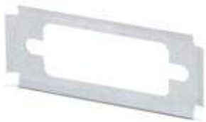
D-SUB EMC shroud, shell size 2, shielded, for panel mounting frame VS-15-...

Please be informed that the data shown in this PDF Document is generated from our Online Catalog. Please find the complete data in the user's documentation. Our General Terms of Use for Downloads are valid ( http://download.phoenixcontact.com )