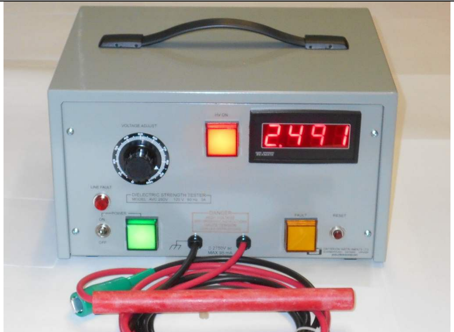
DIELECTRIC STRENGTH TESTER (HIPOT) MODEL AV-25DV-10

This Dielectric Strength Tester, is Ideal for testing: control panels, small transformers, electrical motors, appliances, light fixtures, short electrical cables and similar products.