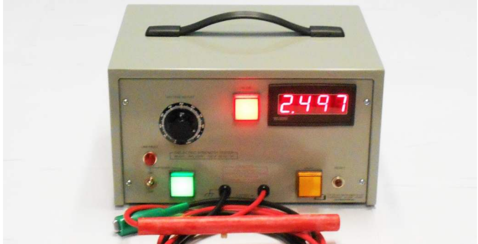
DIELECTRIC STRENGTH TESTER (HIPOT) MODEL AV-25DV-5

This Dielectric Strength Tester is ideal for testing: Control panels, small transformers, small electrical motors, appliances, light fixtures, short electrical cables and similar products.