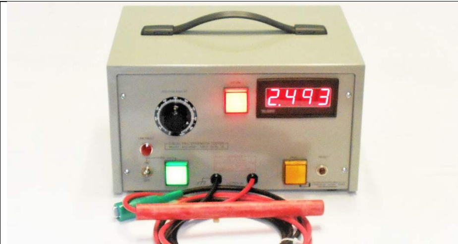
DIELECTRIC STRENGTH TESTER (HIPOT) MODEL DV-25DV-10

PAGE 5 of 6 This Dielectric Strength Tester, is Ideal for testing: Control panels with electronic circuits, appliances, light fixtures with electronic ballasts, electrical cables and similar Products.