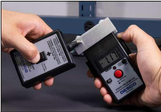
Figure 10. Using the Charger to apply a charge onto the Conductive Plate

NOTE: A ground path must be provided between the touch plate of the Charger and the ground reference of the Digital Static Field Meter. This is normally provided by holding the Charger in one hand and the Digital Static Field Meter with Conductive Plate in the other.