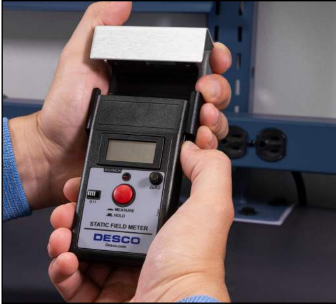
Figure 8. Sliding the Conductive Plate onto the Digital Static Field Meter