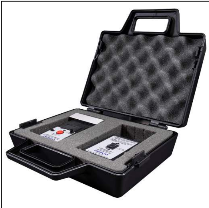
Figure 3. Air Ionization Test Kit and Carrying Case