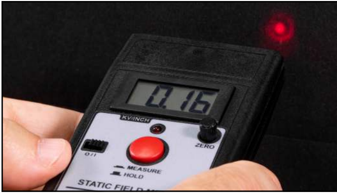
Figure 7. Aligning the two bullseyes emitted by the LED range indicator