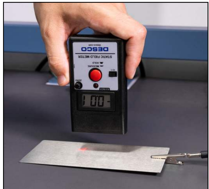
Figure 6. Pointing the Digital Static Field Meter to a grounded surface

Slide the power switch to the right to power the Digital Static Field Meter. Point the top of the Digital Static Field Meter approximately 1 inch (2.5 cm) away from a grounded metal surface. Proper spacing is indicated when the two red bullseyes emitted LED range indicator become centered on top of each other. Turn the rotary zero knob until the Digital Static Field Meter's display reads 0.00.