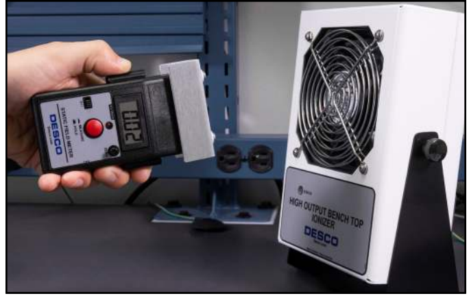
Figure 9. Using the Digital Static Field Meter with Conductive Plate to measure the offset voltage of a benchtop ionizer

NOTE: When testing pulsed ionizer systems, the voltage displayed is constantly changing. This pulse rate may be faster than the display update rate of the Digital Static Field Meter, therefore the displayed voltage is an average of the actual voltage. The output of the Digital Static Field Meter is useful in this situation for more accurate measurements.