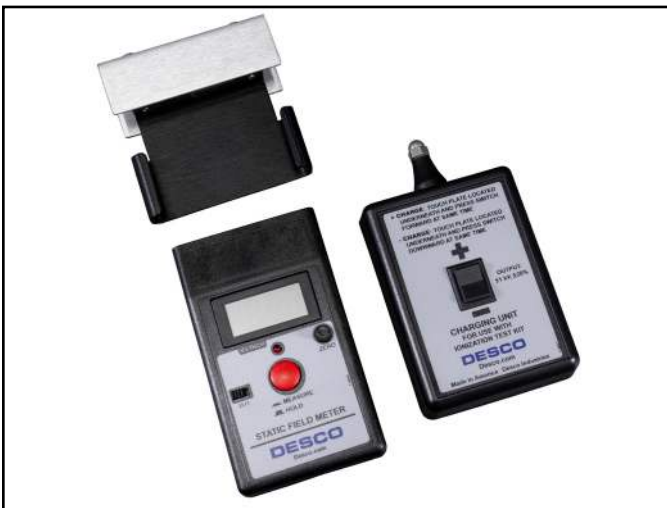
Figure 2. Desco 19443 Air Ionization Test Kit