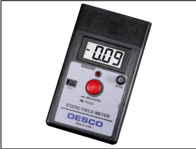
Figure 1. Desco 19442 Digital Static Field Meter