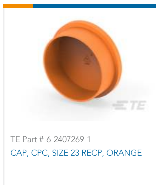
TE Part # 6-2407269-1 CAP, CPC, SIZE 23 RECP, ORANGE