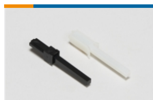
Circular Connector Keying Plugs(2)