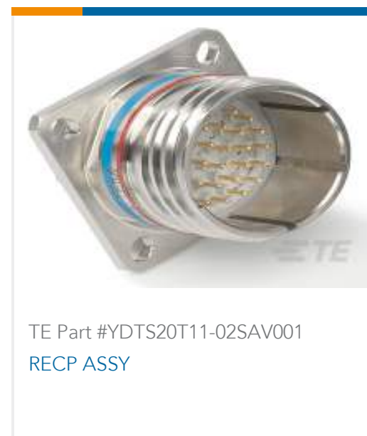
TE Part #YDTS20T11-02SAV001 RECP ASSY