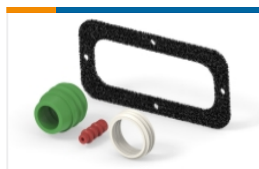
Connector Seals & Cavity Plugs(36)