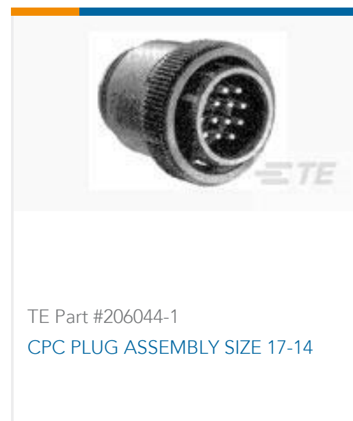
TE Part #206044-1 CPC PLUG ASSEMBLY SIZE 17-14