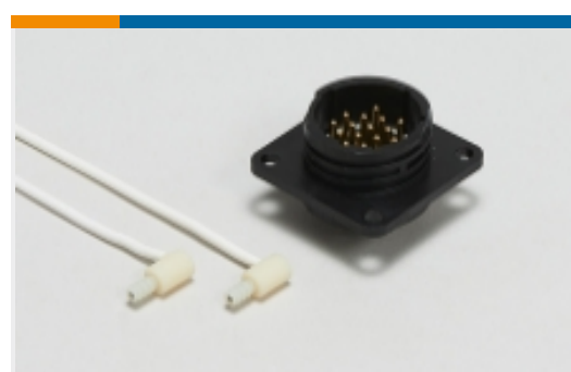
Circular Power Connectors(459)