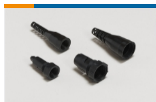
Connector Strain Relief(6)