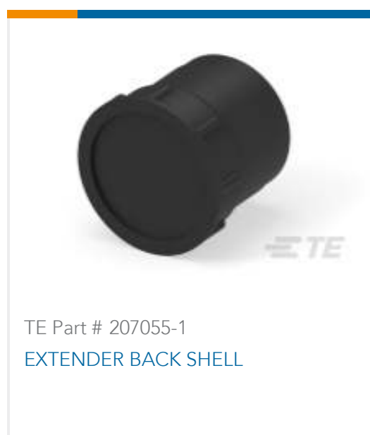
TE Part # 207055-1 EXTENDER BACK SHELL