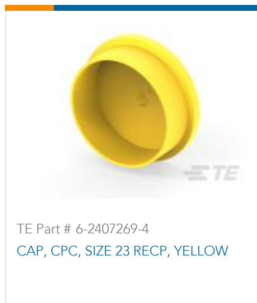
TE Part # 6-2407269-4 CAP, CPC, SIZE 23 RECP, YELLOW