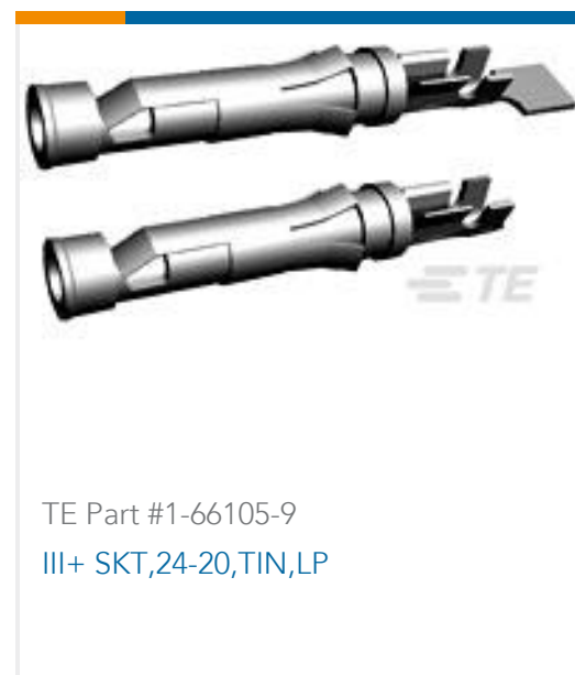
TE Part #1-66105-9 III+ SKT,24-20,TIN,LP