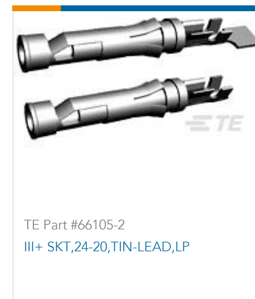
TE Part #66105-2 III+ SKT,24-20,TIN-LEAD,LP