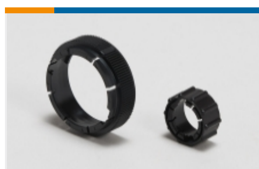
Circular Connector Adapters(7)