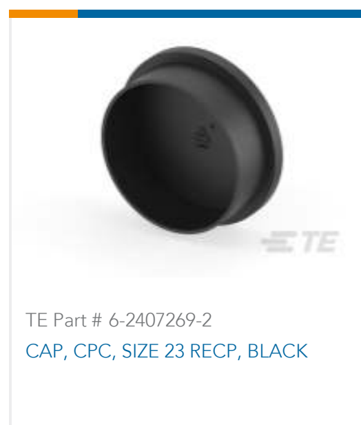
TE Part # 6-2407269-2 CAP, CPC, SIZE 23 RECP, BLACK