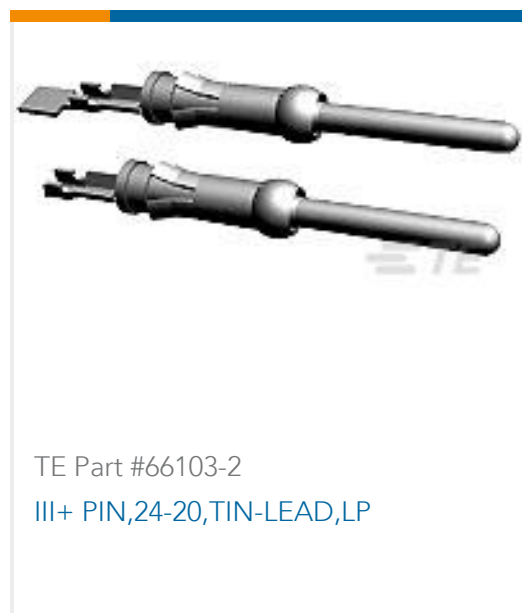
TE Part #66103-2 III+ PIN,24-20,TIN-LEAD,LP