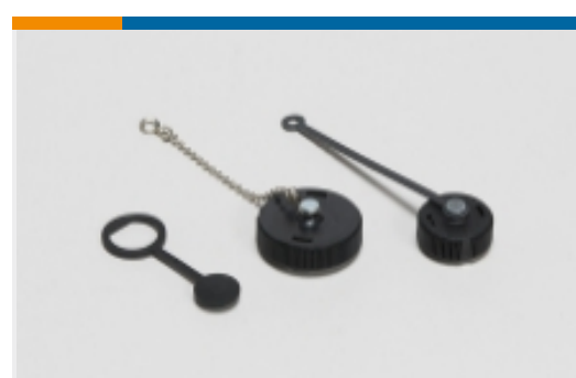
Circular Connector Caps & Covers(16)