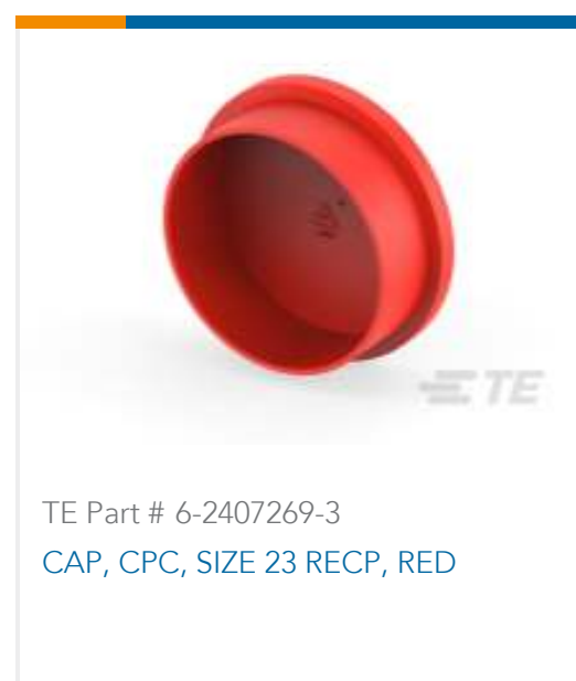
TE Part # 6-2407269-3 CAP, CPC, SIZE 23 RECP, RED