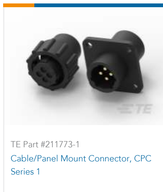
TE Part #211773-1 Cable/Panel Mount Connector, CPC Series 1