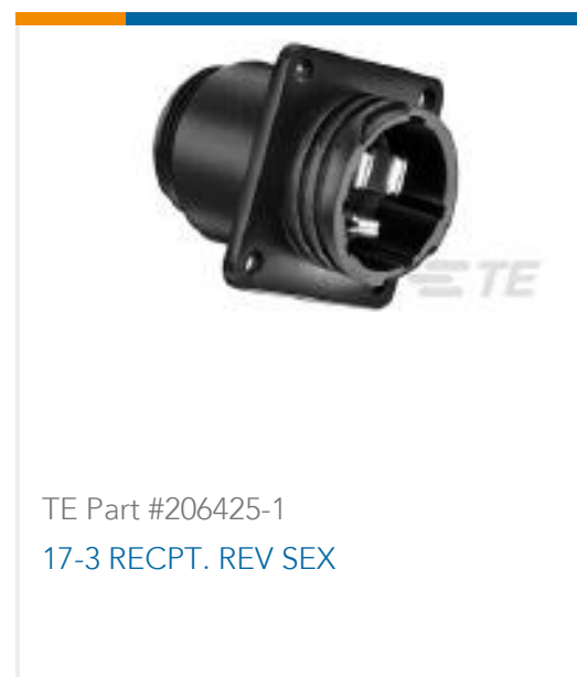
TE Part #206425-1 17-3 RECEPT. REV SEX