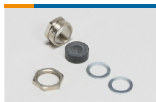
Circular Connector Hardware(3)