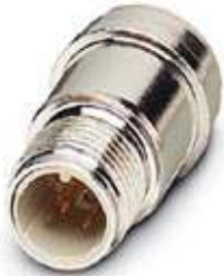
Sensor/actuator flush-type plug, 5-pos., M12, A-coded, front/press-in mounting, with straight solder connection

Please be informed that the data shown in this PDF Document is generated from our Online Catalog. Please find the complete data in the user's documentation. Our General Terms of Use for Downloads are valid ( http://download.phoenixcontact.com )