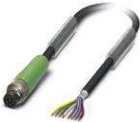
Sensor/Actuator cable, 8-position, PUR, Black RAL 9005, shielded, Plug straight M8, on Free cable end, Cable length: 5 m

Please be informed that the data shown in this PDF Document is generated from our Online Catalog. Please find the complete data in the user's documentation. Our General Terms of Use for Downloads are valid ( http://download.phoenixcontact.com )