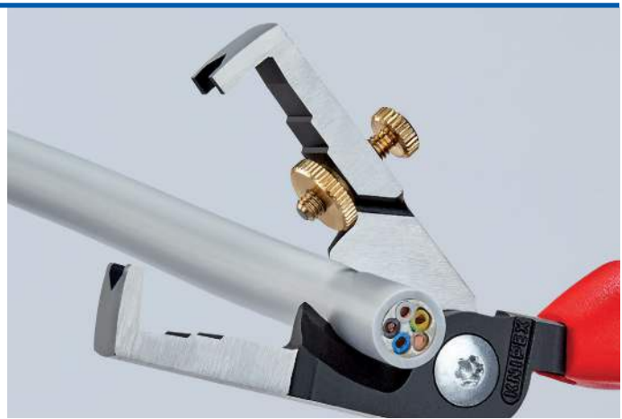
Induction hardened shear blade with precisely ground cutting edges for crushing-free cutting of copper cables up to 9/16" (15 mm Ø) (5 x 2.5 mm 2 )