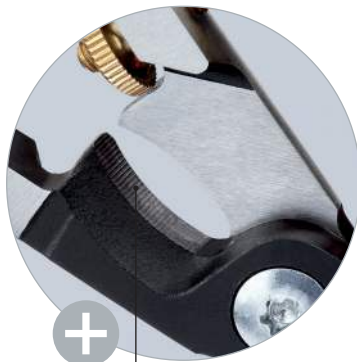
Induction hardened precision blade