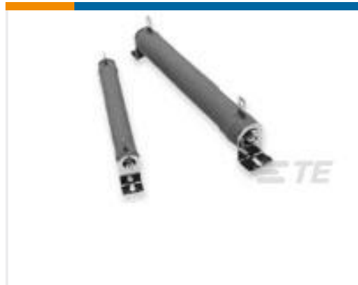
TE Part #3-1879447-3 TE 200W 470R 5% Bracket