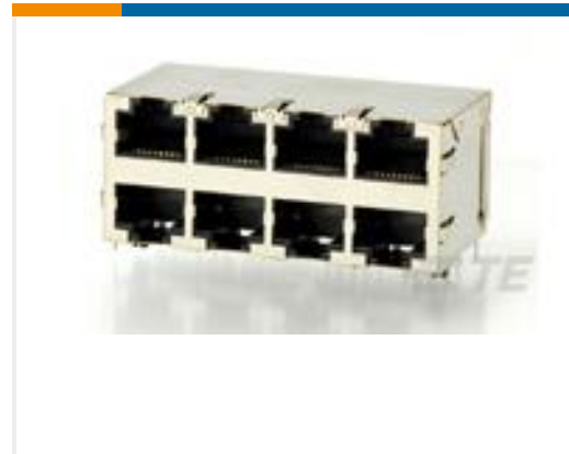
TE Part #6339082-3 LED STK MJ ASSY,2X4,8 POS,CAT5