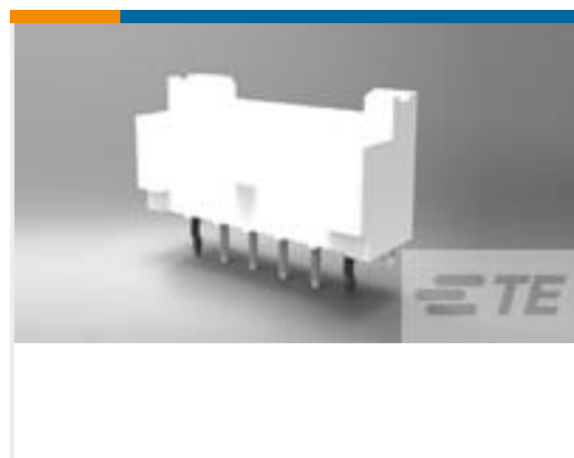
TE Part #1-2132415-5 EP2.5 Shrouded HDR ASSY 15P VERT w/oboss