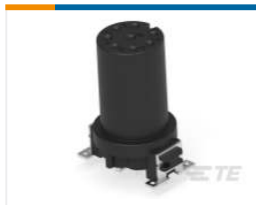
TE Part #254310-E M12 F 8 A H S * 207 17,0 094 * * * * 001