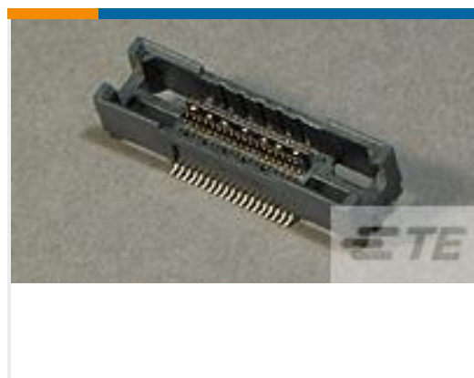
TE Part #767096-8 MICT,REC,038,ASY,.025,TAPE,CAP