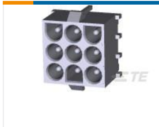
TE Part #194012-1 PIN ASSY..070