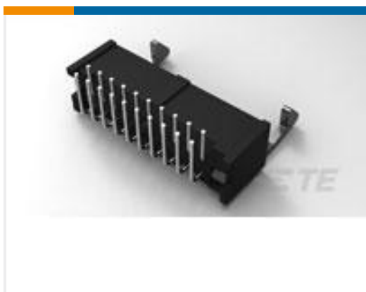
TE Part #1761607-9 IDC LOW PRO HDR 26P RA LG LAT BLK