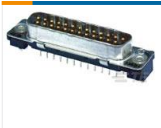
TE Part #5-338311-2 25POS.HD20 PLUG ASS