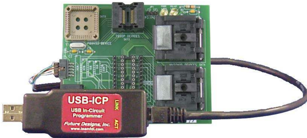
USB-ICP-SAB9 shown with USB-ICP-LPC9xx (USB-ICP-LPC9xx Sold Separately)