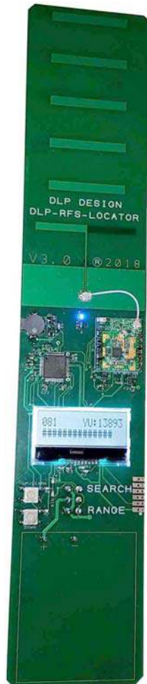
DLP-RFS-LOCATOR - Master Version 3.0

In this demonstration system, there is a single Master transceiver and up to 50 Targets. The hardware for the Master is hand-held and battery powered.