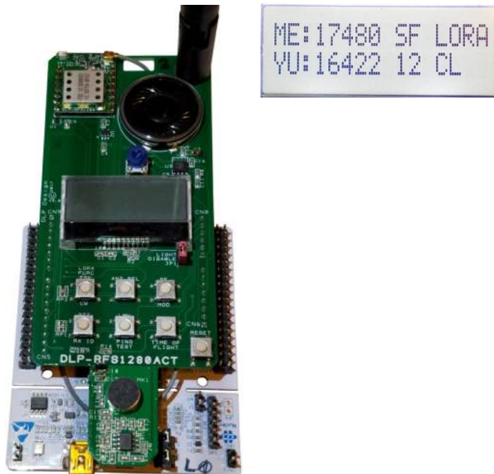
DLP-RFS1280ACT DEMONSTRATION PLATFORM (Serving as a Target for this demonstration)

The system is set up and ready for this demonstration once all Target transceivers are powered and set to LORA Mode. If a Target is set to GFSK or FLRC Mode, simply press Button 1 until “LORA” is shown in the display: