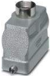
HEAVYCON B24 sleeve housing, for single locking latch, height: 76 mm, with 1 x Pg21 gland, straight cable outlet

Please be informed that the data shown in this PDF Document is generated from our Online Catalog. Please find the complete data in the user's documentation. Our General Terms of Use for Downloads are valid ( http://phoenixcontact.com/download )