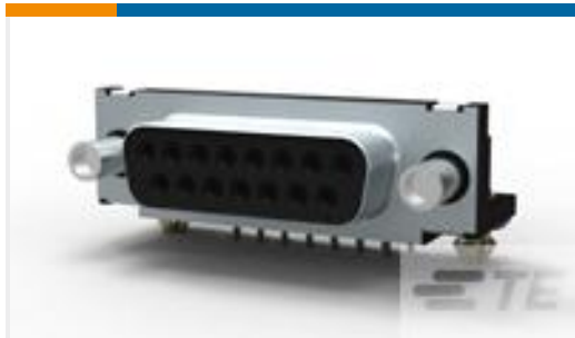
TE Part #5747845-6 15 MSFL RCPT RA 318 (SL,FM,BL)