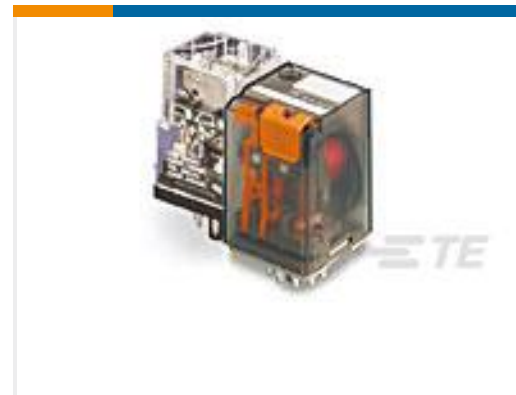
TE Part #4-1393104-5 KRPA-11DG-24=KRPA