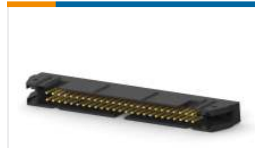
TE Part #5499206-3 AMP-LATCH UNIVERSAL HEADERS