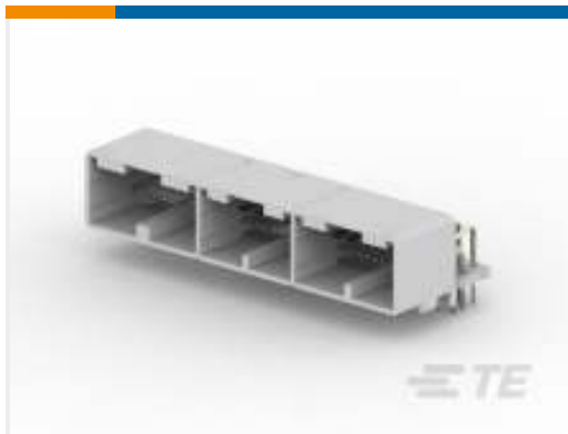
TE Part #2-1318751-0 025/090 56POS CAP ASSY H TIN