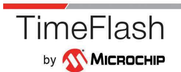
Figure 2. Microchip TimeFlash logo screen

Navigate to the installation location of the program “Timeflash.exe” and then double click on the icon. For convenience, a “shortcut” of this icon in the Start Menu will ease continued use of the software. Initially the TimeFlash application will display a logo with a transparent background (see Figure 1) as a windows screen while the application is launching.