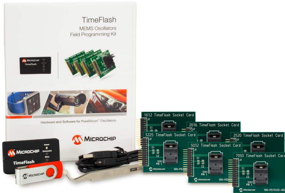
Figure 1. Microchip TimeFlash kit

The Microchip TimeFlash kit consists of the TimeFlash programmer, USB cable, antistatic tweezers, Quick Start guide & installation USB Flash drive.