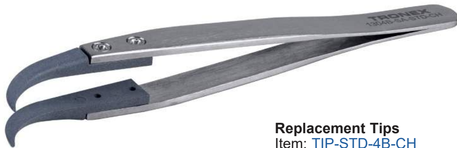
Replacement Tips Item: TIP-STD-4B-CH