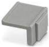
Equipment marker, width 12 mm