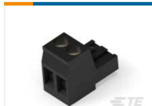
TE Part #2305909-2 SMT TB PARALLEL PLUG, 5.0MM, 2 POS