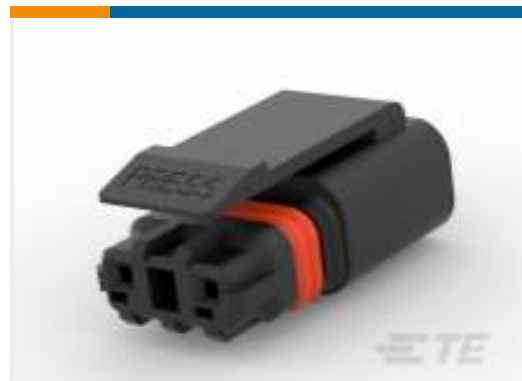
TE Part #2-2834074-2 SlimSeal Miniature Plugs