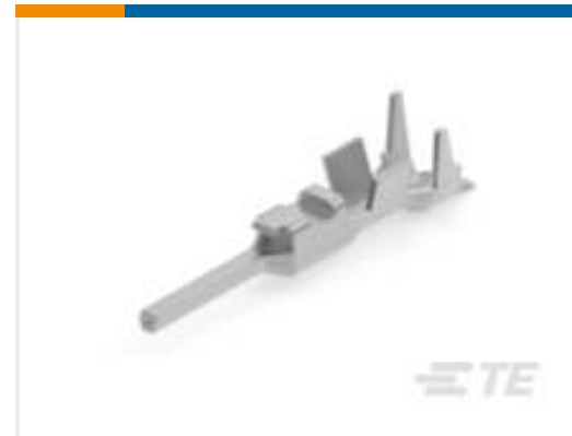
TE Part # 1-2834068-2 PIN CONTACT, MINIATURE WATERPROOF CONN