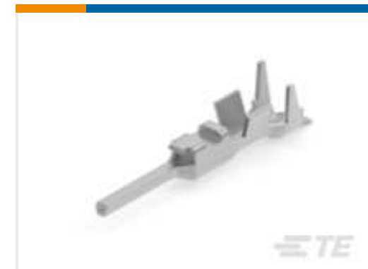
TE Part #2-2834068-2 PIN CONTACT, MINIATURE WATERPROOF CONN