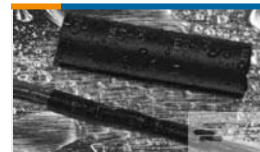
TE Part #CP4937-000 ES2000-NO.4-B7-0-STK-SH