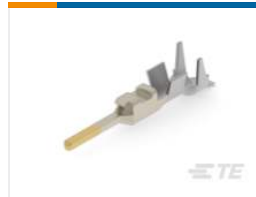
TE Part # 1-2834068-3 PIN CONTACT, MINIATURE WATERPROOF CONN