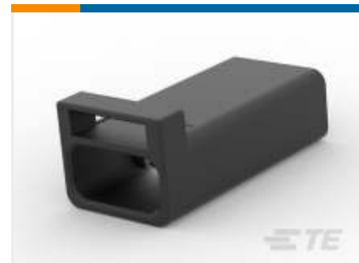
TE Part #2-2834075-3 3P REC, MINIATURE WATERPROOF CONN, BLACK