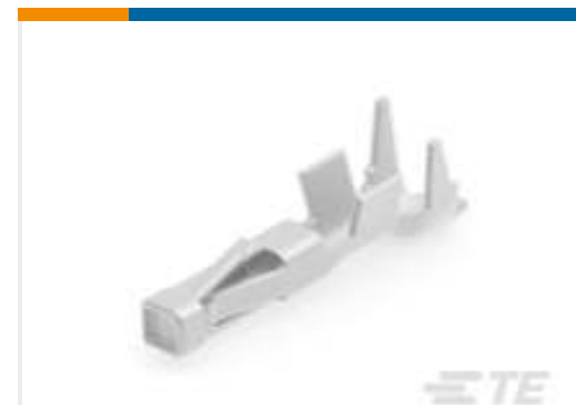
TE Part #2-2834067-2 SOCKET CONTACT, MINIATURE WATERPROOF CONN