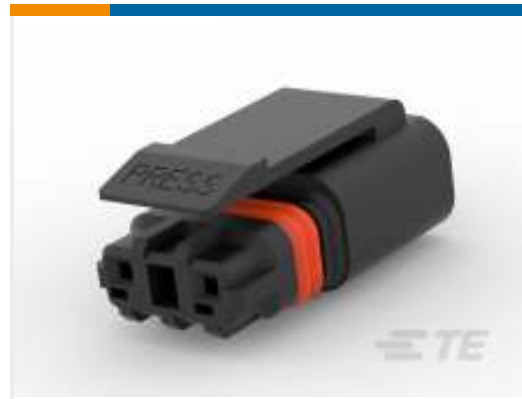
TE Part # 2-2834074-2 2P PLUG, MINIATURE WATERPROOF CONN, BLACK