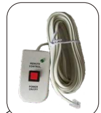
Order No.: RC-1700