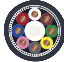
PUR halogen-free black shielded [PUR]