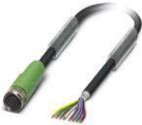
Sensor/Actuator cable, 8-position, PUR, Black RAL 9005, shielded, Free cable end, on Socket straight M8, Cable length: 10 m

Please be informed that the data shown in this PDF Document is generated from our Online Catalog. Please find the complete data in the user's documentation. Our General Terms of Use for Downloads are valid ( http://download.phoenixcontact.com )